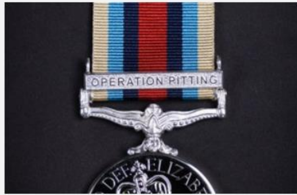
Operation PITTING Medal and Clasp.

Members of the Armed Forces who were deployed in August 2021 to support the evacuation from Afghanistan will receive medallic recognition for their contribution. This was the largest humanitarian aid operation in over 70 years.